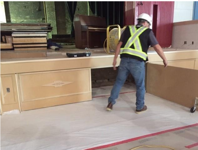
A worker shows the new storage area under the extended stage, August 2020