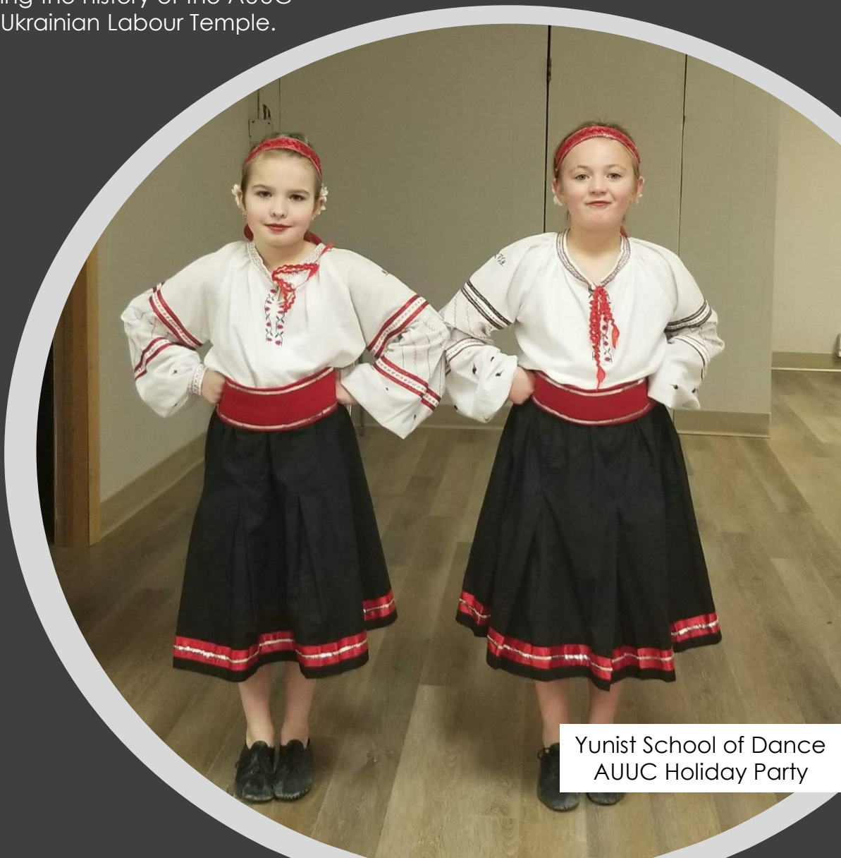
Yunist School of Dance AUUC Holiday Party