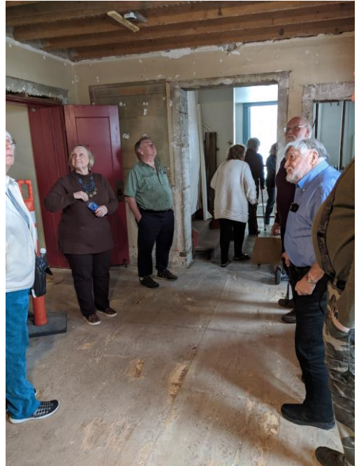
AUUC National Committee tour of renovations, November 2019

We have been successful in securing a number of grants for the project, and are actively seeking donations for the capital campaign for the building. For more information about the process, grants received, and the campaign, see page 7.