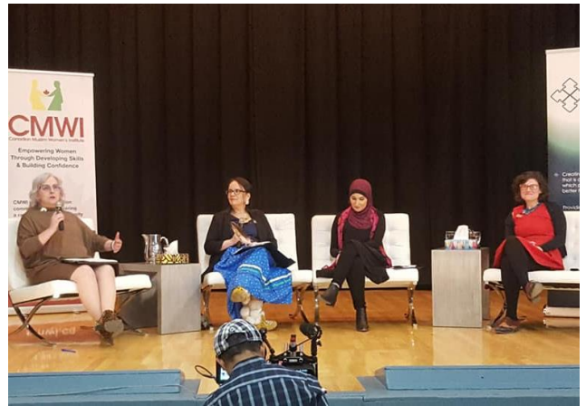
Sorry, not Sorry: Unapologetically Working for Social Justice

weekly play group for children & their caregivers