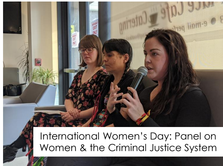
International Women's Day: Panel on Women & the Criminal Justice System

AUUC National Convention October 12-14, 2019