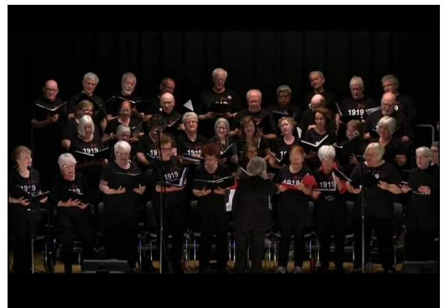
100 th Anniversary of the Winnipeg General Strike Winnipeg Labour Choir