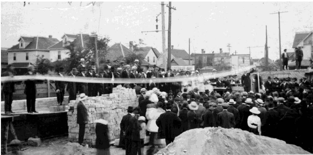
Workers gather to lay the cornerstone for the Ukrainian Labour Temple in 1918

Winnipeg's Ukrainian Labour Temple, the birthplace of our organization, is a National Historic Site.