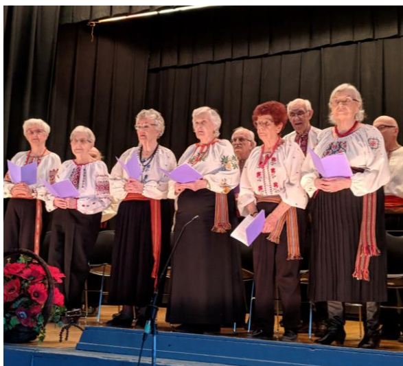
Festival Choir 1919 Strike Conference Banquet