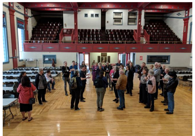
1919 Winnipeg General Strike Centenary Conference Bus Tours