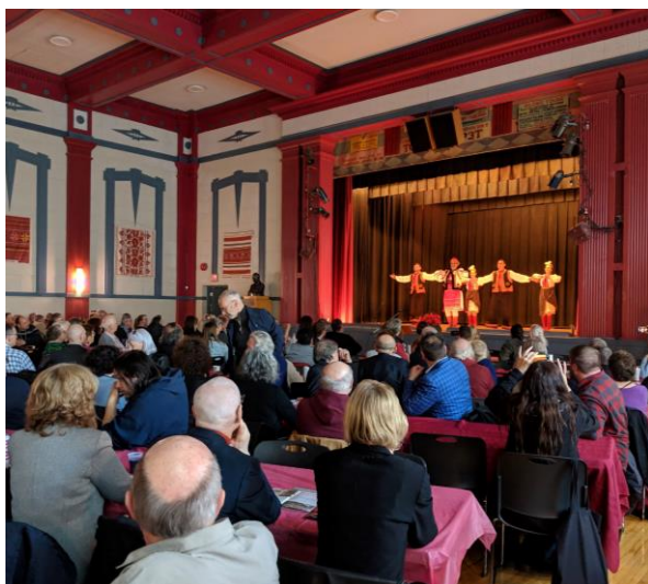
Yunist Dance Ensemble 1919 Strike Conference Banquet