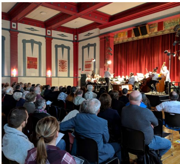
Winnipeg Mandolin Orchestra In Concert